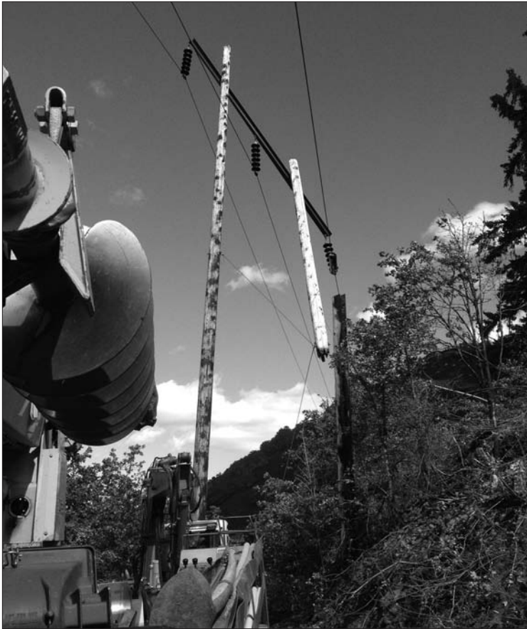
Left, damage to the 69kV transmission structure that brings power from BPA's Bald Mountain Substation to the KPUD Husum Substation. Although the pole was burned in two by the fire, no power outage resulted from the damage.