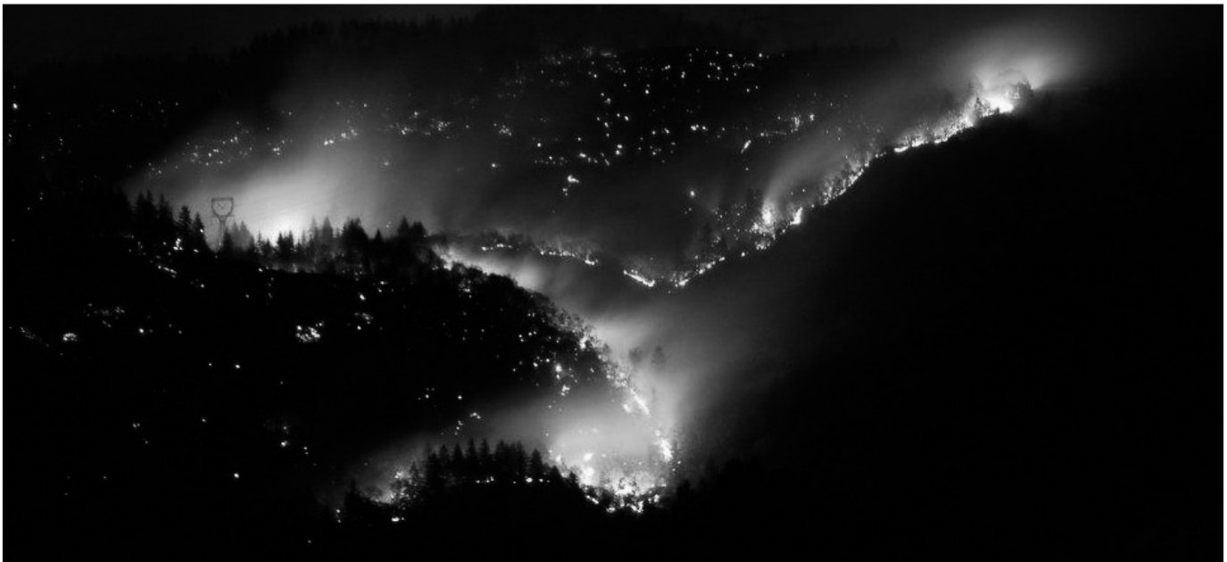
The night glows eerily as fires continue for more than a week. More than 1,600 acres burned.